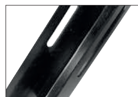
PROCESS THREE ED coating process: electrophoretic deposition (aka ED or EPD) coating